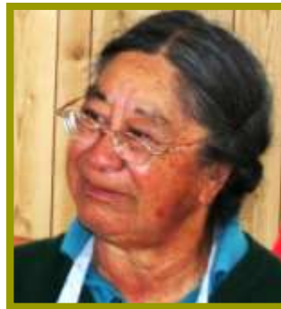
E taku huia kaimanawa ka maringi tonu nga roimata Moe mai aunty i te huinga kahurangi Ki reira hoki piataata mai ai Moe mai i te rangimārie.

years to primary education. Acutely aware about the home life of many of her students, aunty always encouraged them to aim high: "Whatever you choose to do in life, do so to the best of your ability. Even if you choose