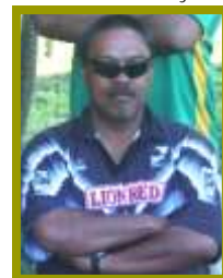
We will miss your smile and your laughter and we will never ever forget you.

You will be remembered by us all. Your death has left a great big hole in our hearts that only time can heal. We bid you farewell and your precious memories will live on because you touched our hearts in so many ways.